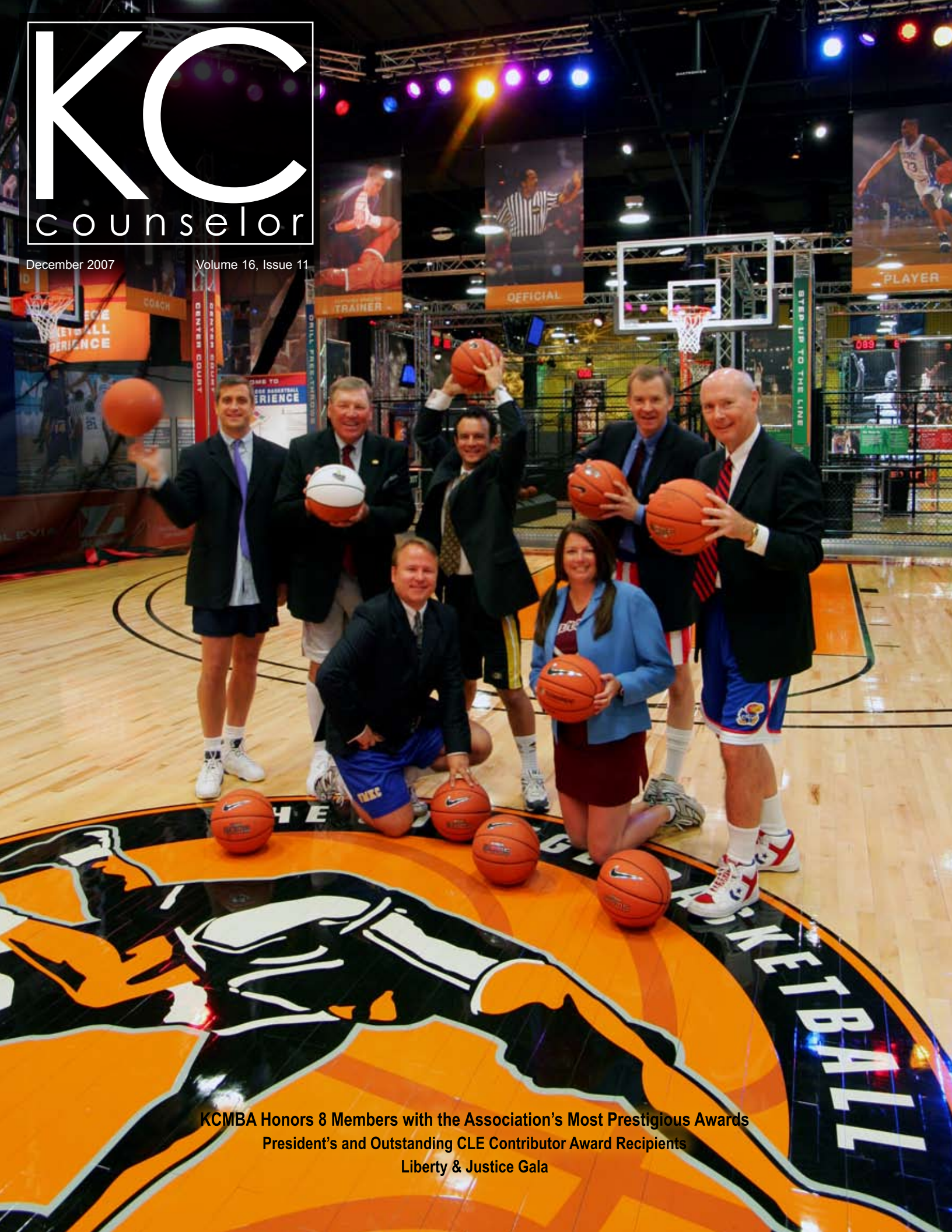
KCMBBA Honors 8 Members with the Association's Most Prestigious Awards President's and Outstanding CLE Contributor Award Recipients Liberty & Justice Gala